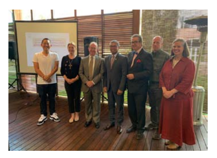
Collected and translated by Kenny Raharison

Satisfactory results are being felt: many suspects are being held accountable before the law. Some senior officials think they will escape because of the delay in the operationalization phase of the High Court of Justice, which is a legal and political jurisdiction specialized in dealing with cases involving senior officials. The procedural rules applicable to this effect seem complex and long and suggest the possibility that those concerned can circumvent the justice system. Credible follow-ups to these major cases depend on the rebuilding of public confidence – a public who is thirsty for justice."