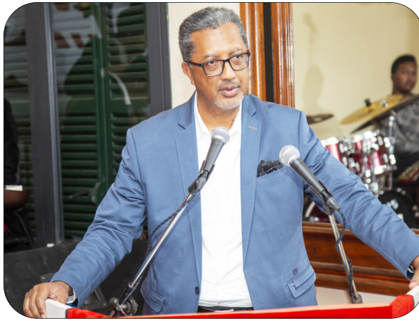
H.E. Mr. Richard Randriamandrato, Minister of Economy and Finance, was AmCham's Guest of Honour at the annual gala. He ended his speech by requesting Malagasy people's patience and trust in the current government.