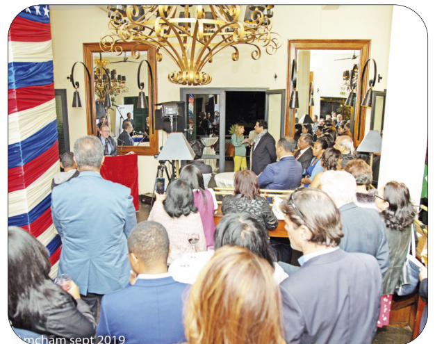
The AmCham Madagasca Gala 2019 was more than AmCham's annual gathering, it was more a "family" event.