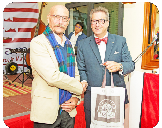
Two gift baskets were offered to two lucky AmCham members by Dzama, one of the partners of the event.