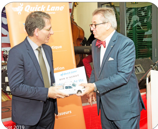
Materauto offered 3 gift cards of MGA 200,000 each and 3 Ford miniature card models to 3 lucky attendees.